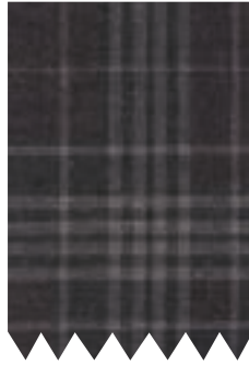
Hebridean Grey Boy's and Men's Kilts