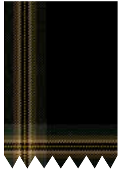
Black Galloway Men's Kilts