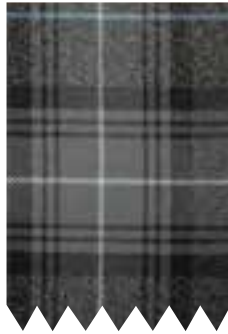
Highland Granite Blue Boy's and Men's Kilts