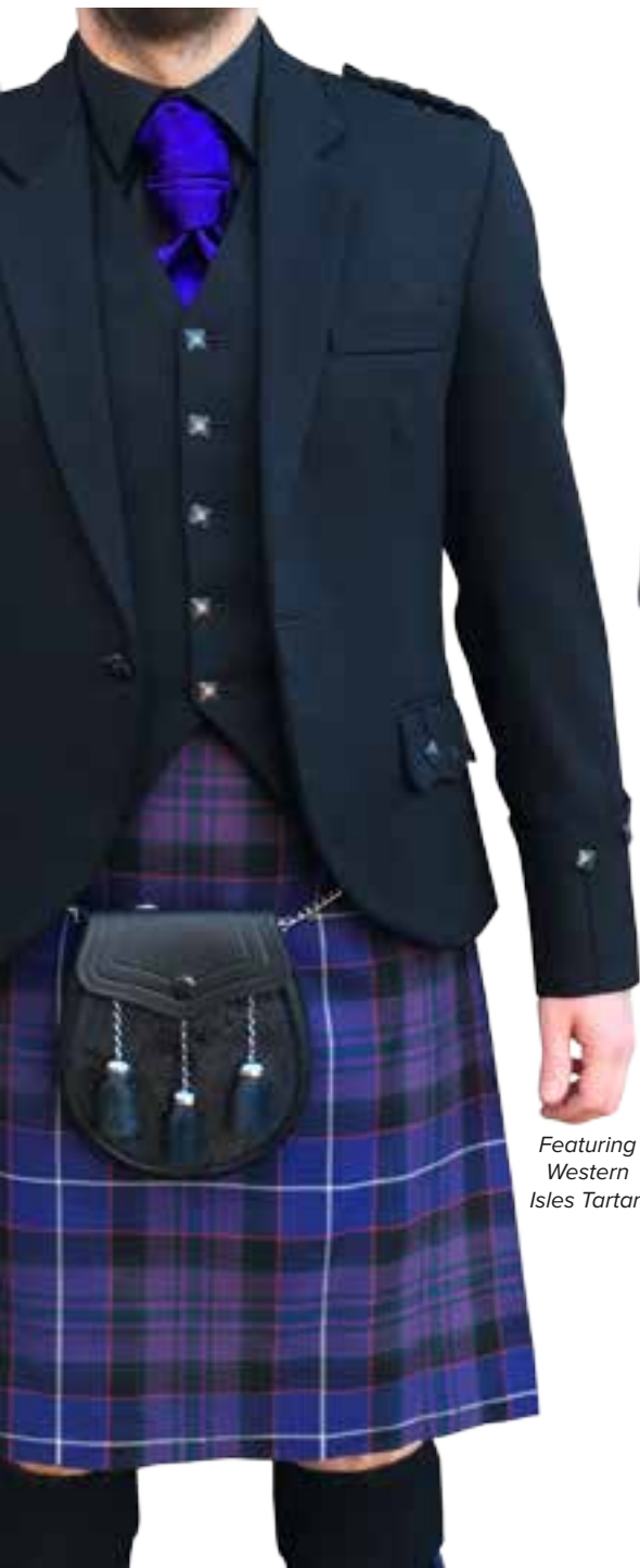
Featuring Western Isles Tartan