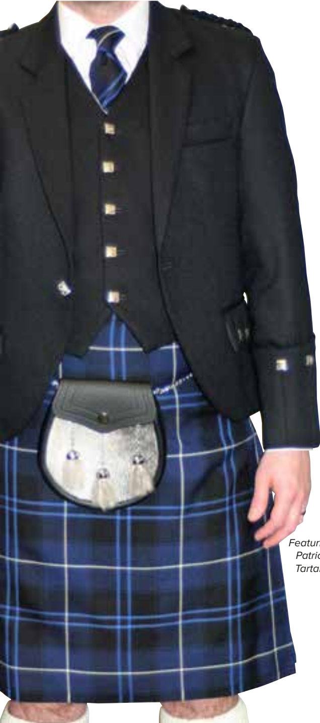
Featuring Patriot Tartan.