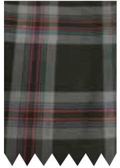
Lionheart Tartan Boy's and Men's Kilts