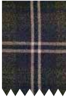
Grey Galloway Boy's and Men's Kilts