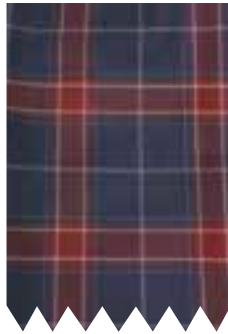
Modern Queen of the South Men's Kilts