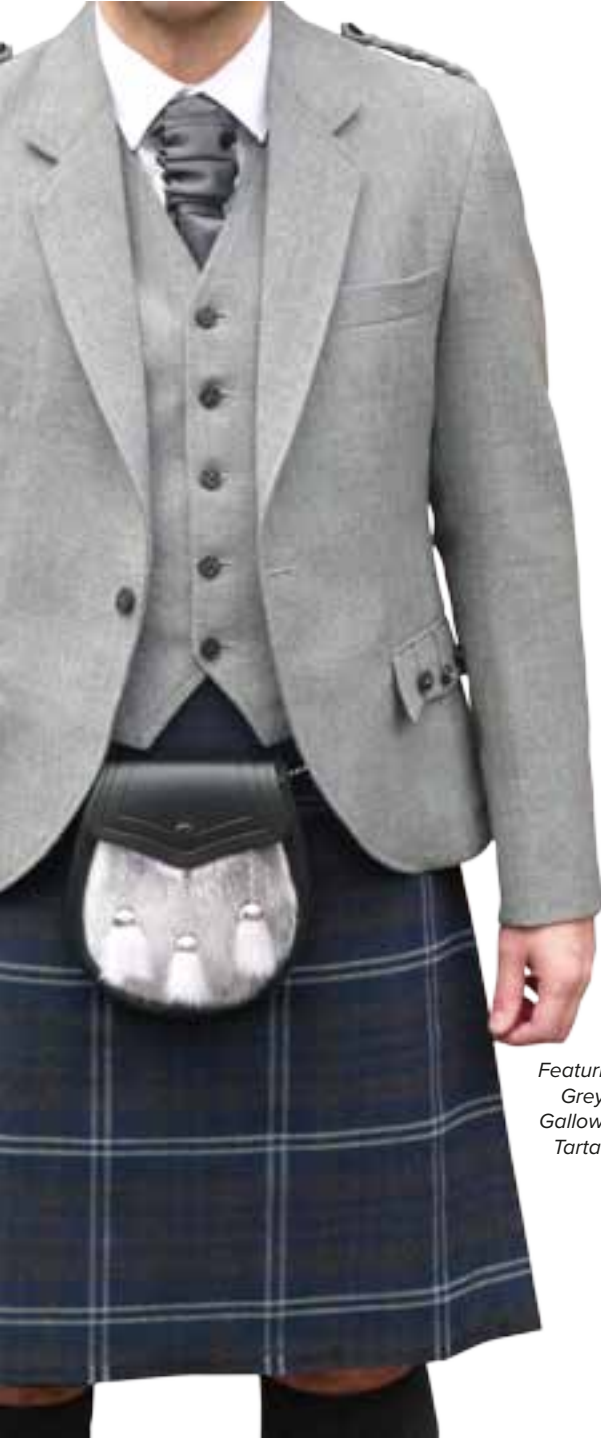
Featuring Grey Galloway Tartan