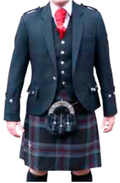
Featuring upgraded sporran and Lionheart tartan