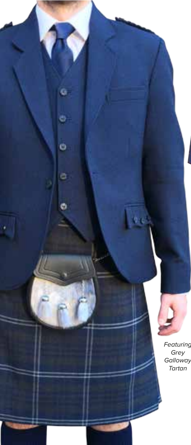
Featuring Grey Galloway Tartan