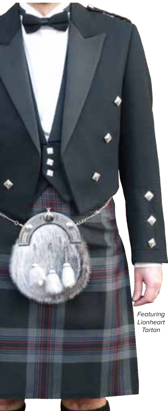
Featuring Lionheart Tartan