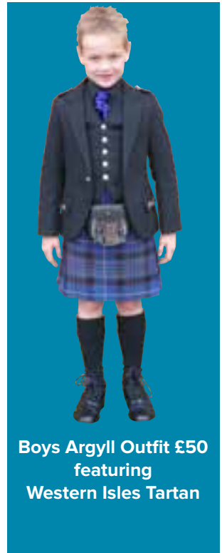
Boys Argyll Outfit £50 featuring Western Isles Tartan