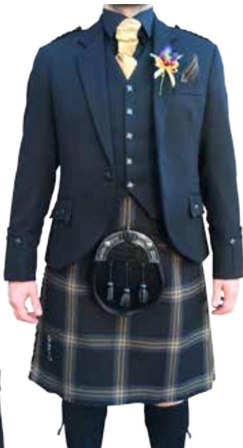
Featuring Black Galloway Tartan