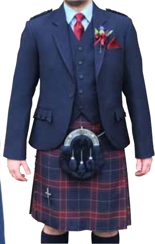
Featuring Modern Queen of the South Tartan