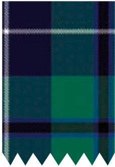
Modern Douglas Boy's and Men's Kilts