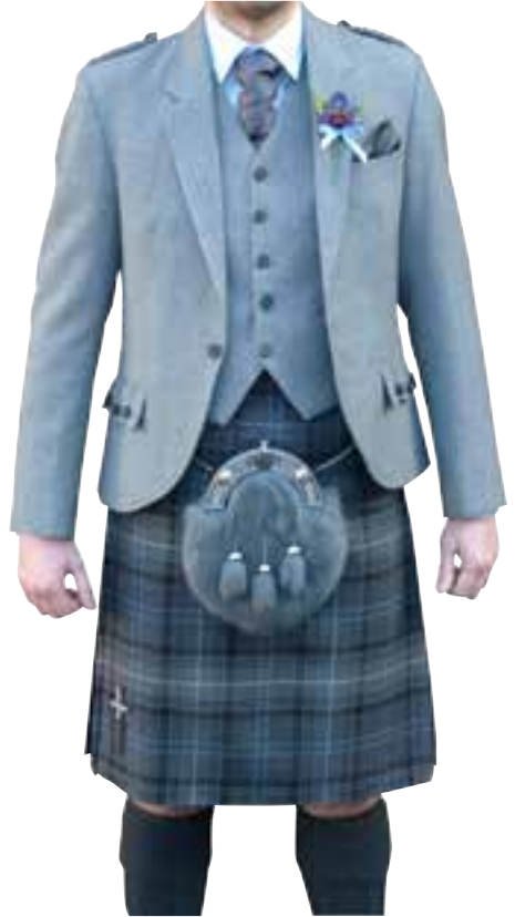
Featuring Highland Granite Blue Tartan