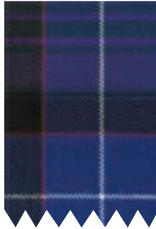
Western Isles Boy's and Men's Kilts