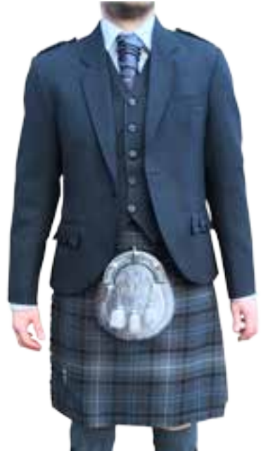
Featuring upgraded sporran and Highland Granite Blue Tartan