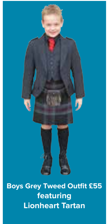
Boys Grey Tweed Outfit £55 featuring Lionheart Tartan