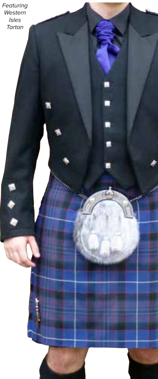
Featuring Western Isles Tartan